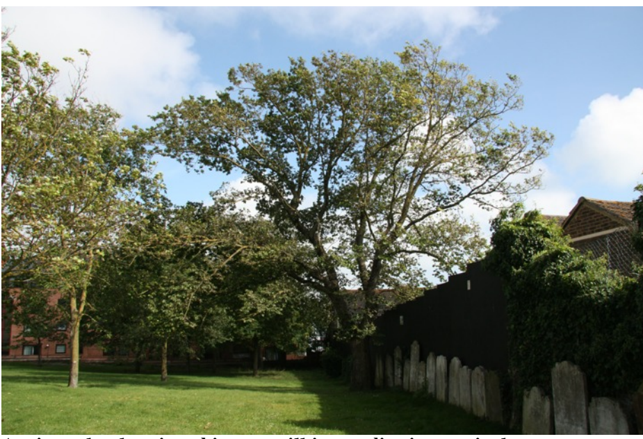
Ancient elm: lopping this tree will jeopardise its survival

In the case of the ice rink, officers twice told members of the committee that because they had failed to agree the reasons for refusal after the first vote this amounted to a vote in favour of the scheme. This was misdirection, say the lawyers.