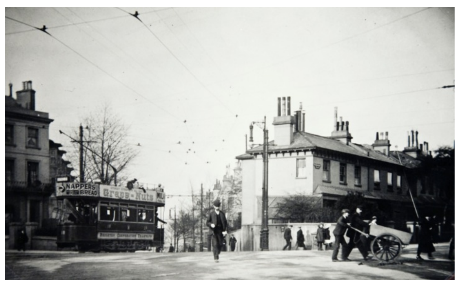
In 1905 traffic at the Seven Dials consisted of a tram and a handcart

At the time the land around the Seven Dials was mostly used for