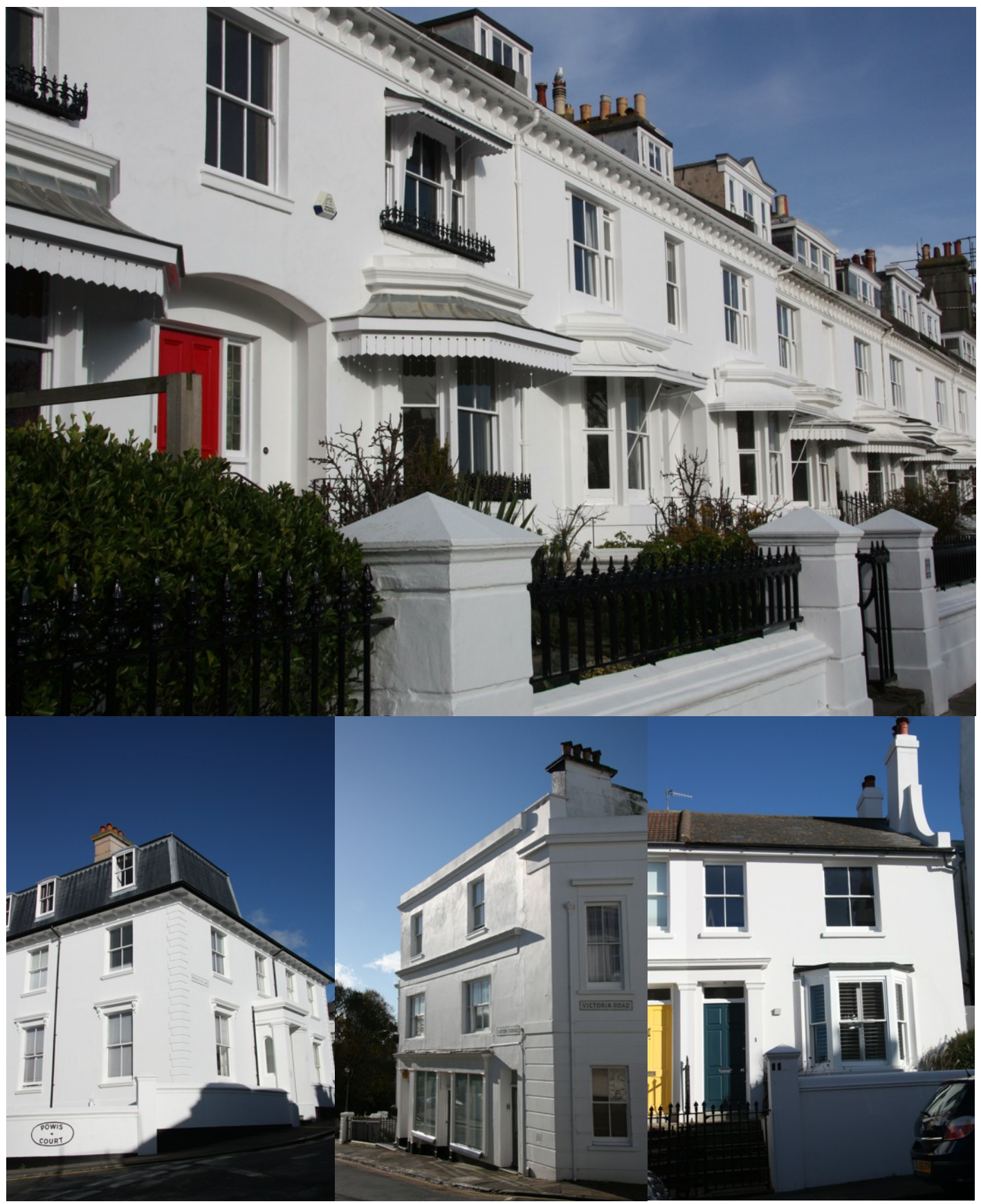
Clifton Terrace (top), bottom row from left to right, 1 Powis Villas, 26 Clifton Terrace and 11 Victoria Road Page 5 MCHA November 2012