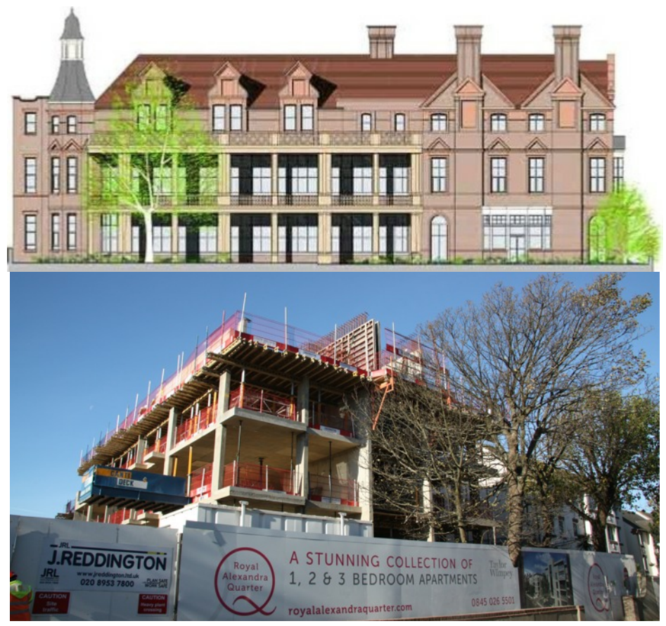
The restored Alex as it will look (top) and work in progress on Dyke Road

Much of the fine detail on the front of the Alex is in terracotta.