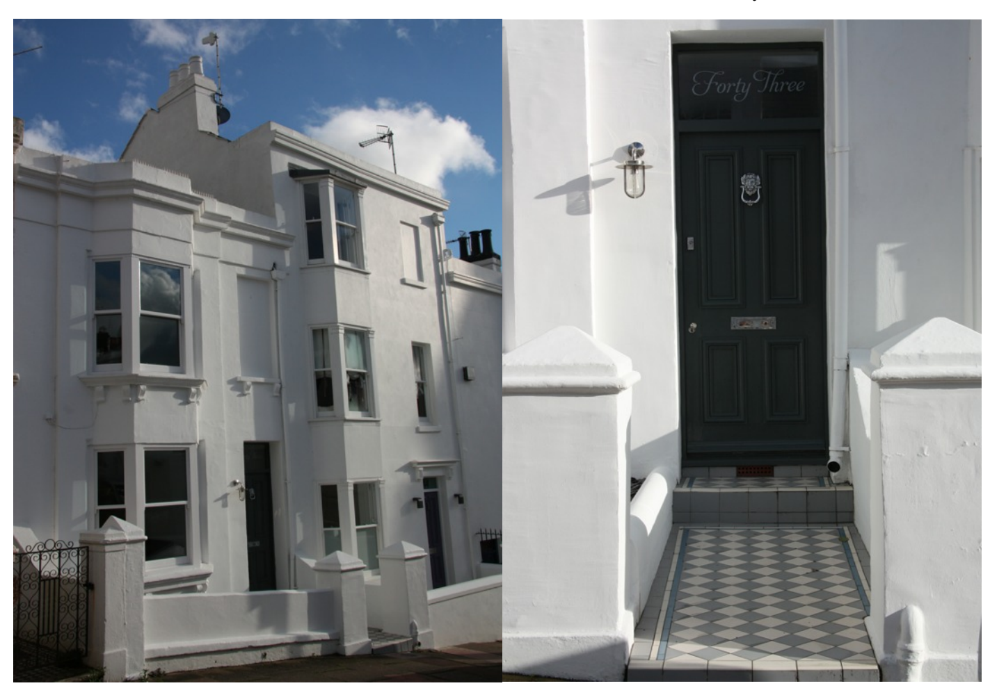
Next door neighbours: 43 and 44 Victoria Street with a close-up of the path at 43 (right)

"The finished facade is the product of months of sustained effort and is a massive improvement to the street," says Graham Towers.