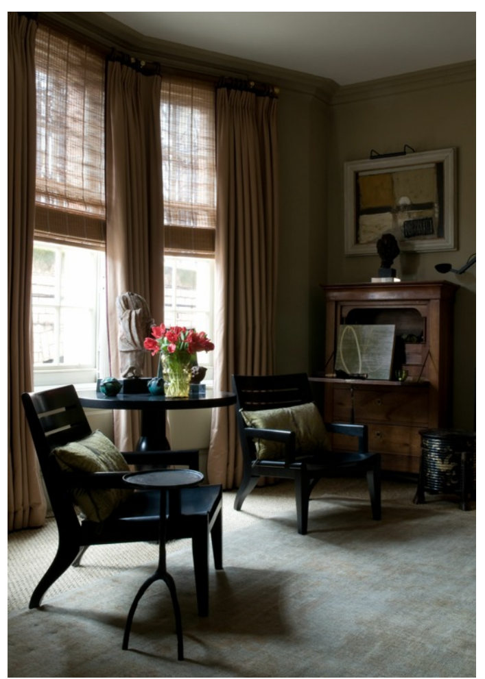
Curtain comfort: where science meets elegance

The researchers were able to measure this heat loss through the glass. On the inside of the room where the air temperature was 72 °F the surface temperature of the glass was just 54 °F.