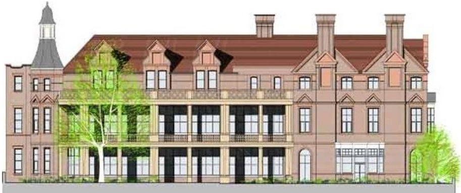
The shape of things to come? How Taylor Wimpey plans to transform the facade of the principal hospital building

The submission of two parallel planning applications is a puzzling strategy and will raise a lot of doubts about the company's true intentions for the site. The inspector at the last public inquiry said the main building made a positive contribution to the conservation area. One of the things that the company will now have to show in trying to persuade the council to allow wholesale demolition is that it is impractical to convert the main building. Yet by submitting a conversion scheme the company has shown that it is practical to convert the main building.